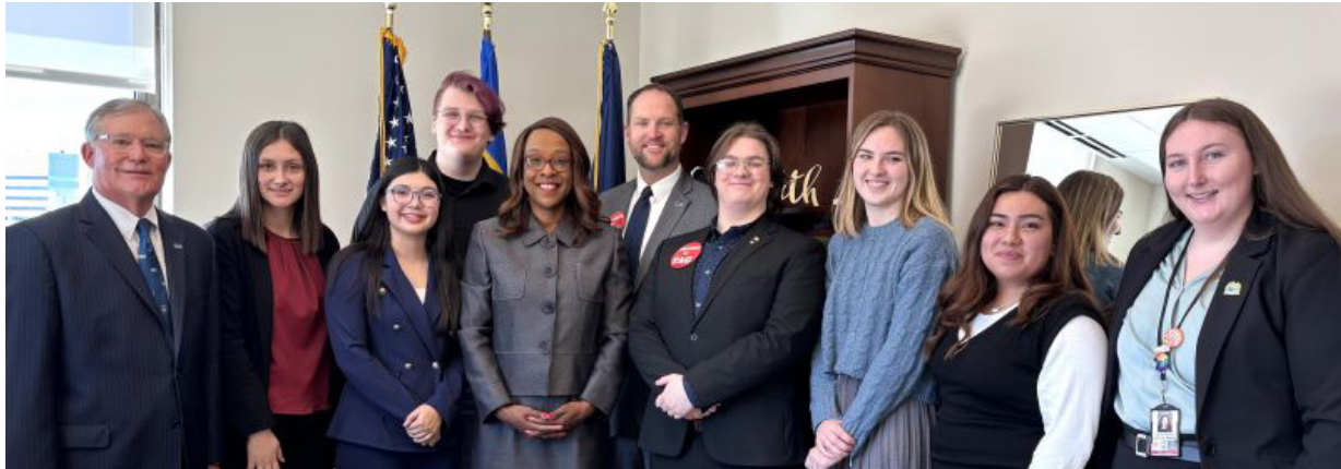
VWU delegation meeting with Virginia State Senator Angelia Williams-Graves