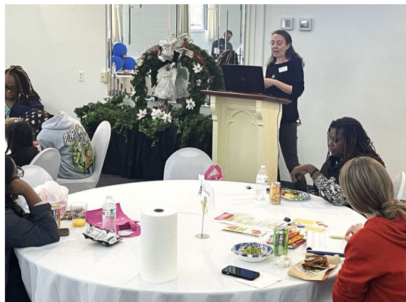
Dr. Malcolm presents heat mapping results

In March, VWU, in collaboration with the Center for Sustainable Communities and other key partners, convened at New Bethel Baptist Church in Portsmouth to present findings from last summer's heat mapping campaign and engage the community in developing strategies for heat mitigation. The findings showed neighborhoods with dense asphalt and concrete recorded temperatures among the hottest in the entire Commonwealth of Virginia, posing a significant public-health risk for elderly residents, low-income residents lacking heat protection, and those with preexisting health conditions. What can fix it? Recommendations included aggressive tree planting efforts, removing unnecessary concrete surfaces, and promoting green infrastructure.