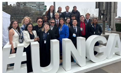
VWU Delegation in New York City

In April, VWU's 18-member delegation represented Montenegro at the National Model United Nations Conference. The event brought together more than 1,500 students from over 140 institutions across more than 50 countries, fostering crucial collaboration to address top global challenges. Topics of focus included preventing the use of chemical weapons by non-state actors, protecting human rights during peaceful protest, and addressing the global impacts of climate change. Students also met with Dr. Jovan Mirkovic, Ambassador of Montenegro to the United States, who shared insights into Montenegro's distinction as the world's first constitutional "ecological state" committed to environmental and social justice.