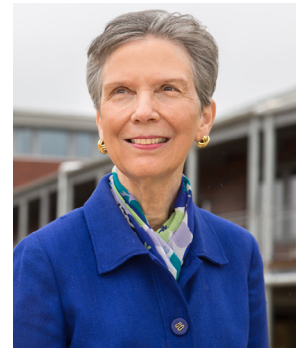
Anne B. Shumadine

"Building 3" in the six-building Honors Village located on campus was renamed Anne B. Shumadine Hall in honor of the late Hampton Roads business leader who was instrumental in designing the academic and business model of VWU's prestigious Batten Honors College.