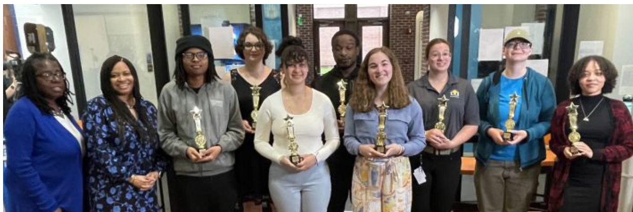
Students honored at inaugural Student Worker ALL-STAR awards